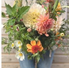
Gifts Weddings Events Farewell Flowers Courses in Growing & Floristry