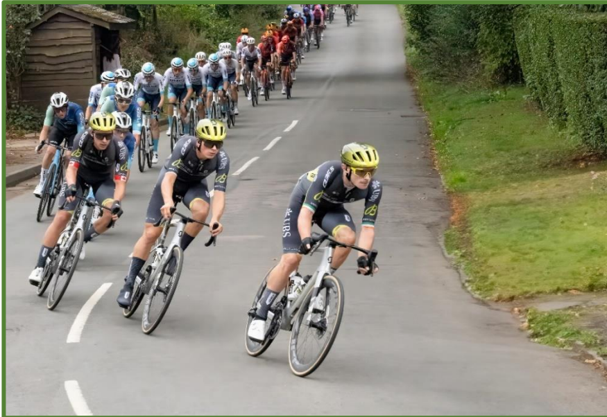
The race enters Culworth.

Saturday 7 th September saw a stage of the Tour of Britain Cycle Race travelling through West Northamptonshire, starting and finishing in Northampton, and passing through Culworth.